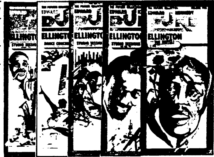
LMR CD 83000 LMR CD 83001 LMR CD 83002 LMR CD 83003 LMR CD 83004 (ctd. p.4) -

This set (another one will follow later) is an ultimate must for all Ellington collectors, we dare say especial- ly for those of our members and Scandinavian aera radio listeners who have access to the Mercer donated material as broadcast by the Danish Radio. Besides the self value of